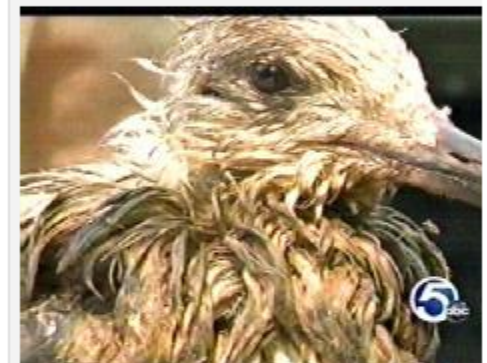
Hundreds of gulls were killed by what appeared to be a cooking oil spill

More that 500 ring-billed gulls were found dead and 30 or 40 others covered in oil near the ArcelorMittal Steel plant, EPA investigator Jim Irwin said Friday.