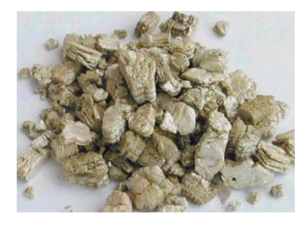
Typical vermiculite insulation