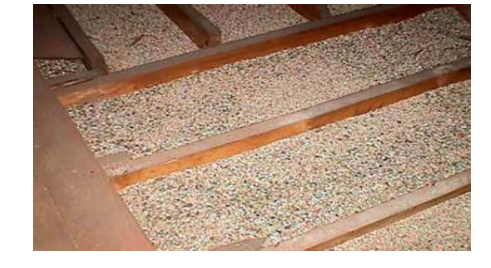
Vermiculite insulation between attic joists