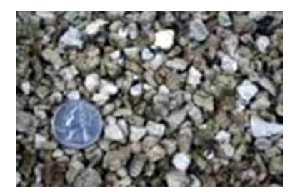
Typical vermiculite insulation

You should assume that your vermiculite insulation contains asbestos. Here are some pictures of vermiculite insulation: