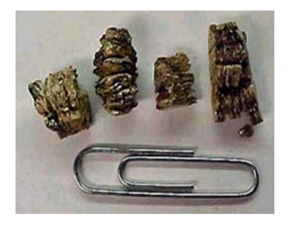
Vermiculite insulation particle size relative to paper clip