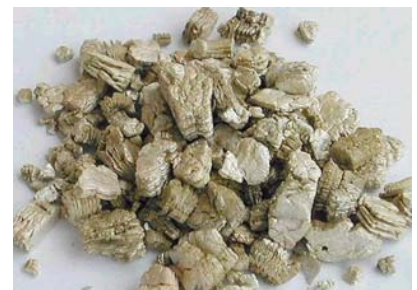
Typical vermiculite insulation