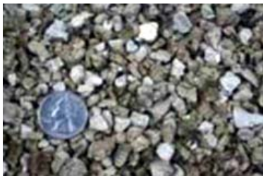
Typical vermiculite insulation

You should assume that your vermiculite insulation contains asbestos. Here are some pictures of vermiculite insulation: