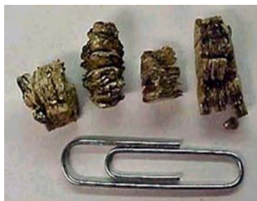
Vermiculite insulation particle size relative to paper clip