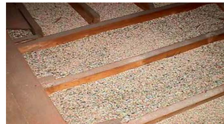
Vermiculite insulation between attic joists