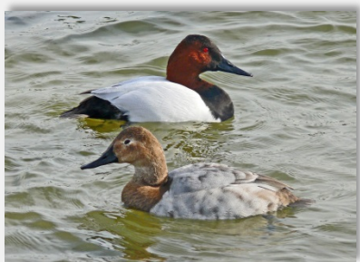
Canvasback Aythya spp.