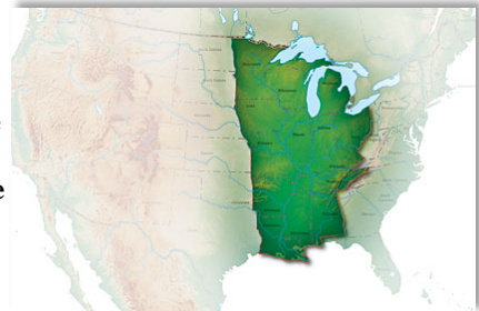
Mississippi River Flyway

Thousands of waterfowl congregate in some of the pools on the Upper Mississippi River during the peak migration times, generally occurring around March/April and October/November. Waterfowl typically stage for longer periods during the fall migration period.