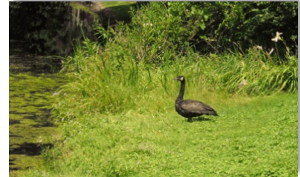
Oiled Canada goose

Wildlife Resources Webinar Training: oil spill response modules. Hosted by: USEPA, USFWS, USDA APHIS. 9/11/2014.