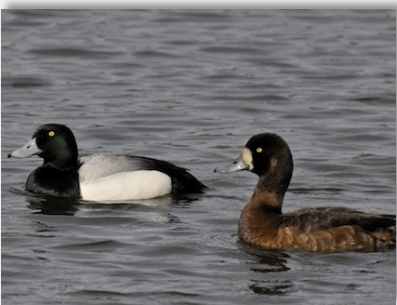
Greater Scaup Aythya spp.