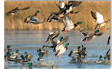
Mallards take flight