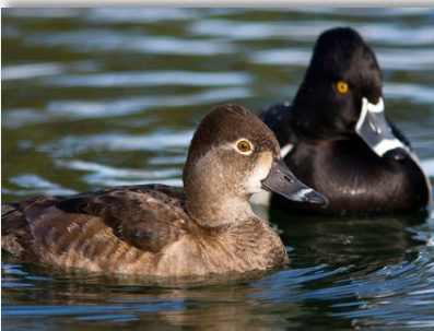
Ring-necked Duck Aythya spp.