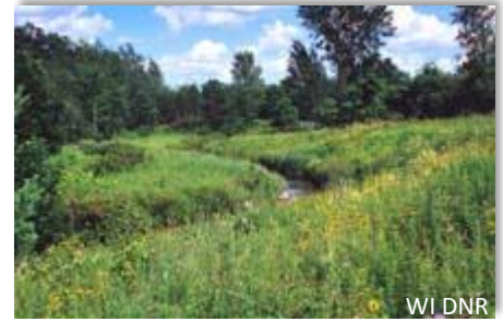
Calcareous fen in Wisconsin

As they occur on sites of cold water seepage, active springs and trout streams are often associated with fens.