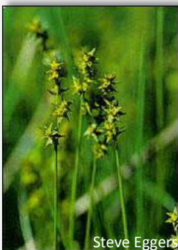
Ohio Goldenrod Solidago spp.