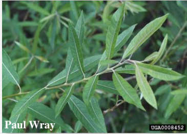
Willow Salix spp.