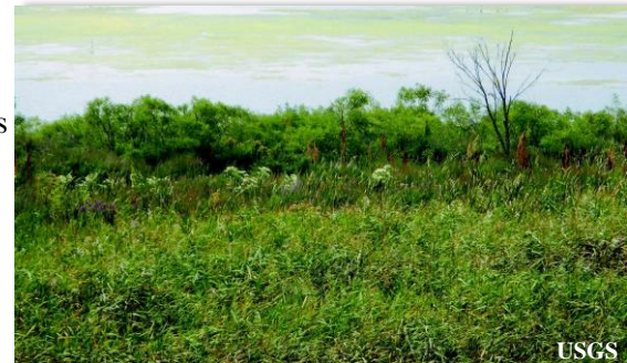
Shrubs along marsh edge

The Shallow Marsh Shrub Habitat represents areas near the shoreline or around lakes, ponds, and backwaters that are >25% vegetated with seasonally flooded shrubby vegetation. It typically grows with mixed emergents, grasses, and forbs. This general class tends to be drier than deep marsh shrubs, but wetter than wet meadow shrubs. Willows ( Salix ) are the predominant shrub type. Other indicator species are Dogwood ( Cornus ), False Indigo ( Amorpha ), and Swamp Privet ( Foresteria ). Shallow marsh shrubs are typically found growing on soils that are saturated or inundated with little water.