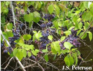
Swamp Privet Foresteria spp.