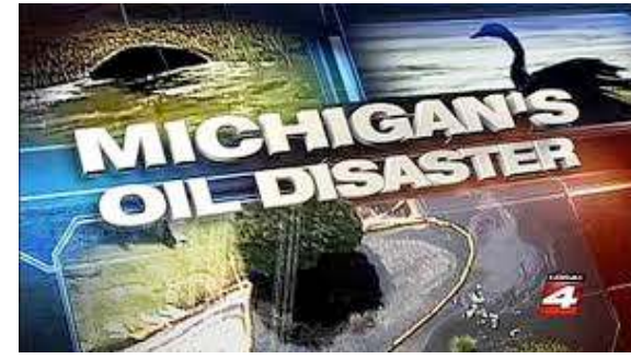
Figure 6. Marshall, MI, July 2010.