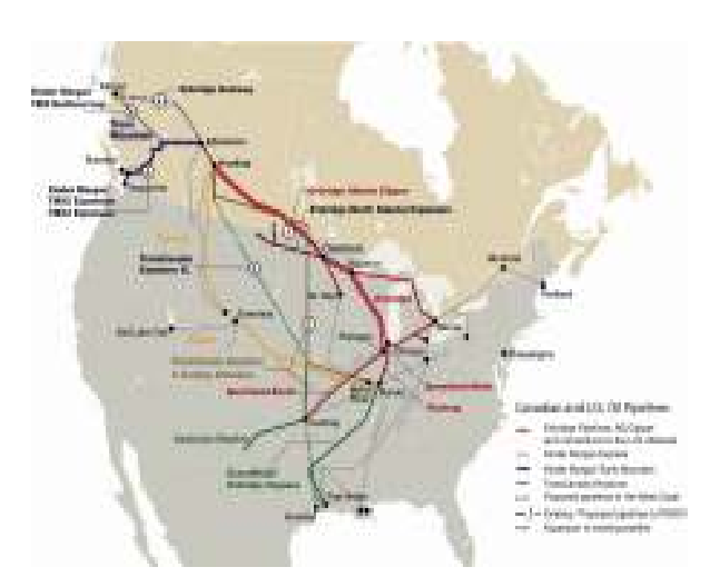
Figure 4. Existing and planned oil pipelines in North America. Canadian Association of Petroleum Producers.

One consequence of this has been the phenomenal growth in rail shipments of oil in the last four years. Rail transports offers the main advantage of requiring no additional review or permitting.