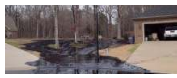
Figure 5. Mayflower, AR, April 2013.

In some regions like the Pacific Northwest, contingency planning will be significantly affected by increased volumes of oil being transported by pipeline, rail, and vessels. Agencies and responders are scrambling to catch up with the emerging risks represented by large amounts of different new oil being moved through the area.